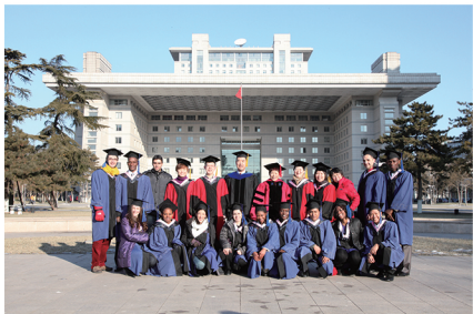
The First Graduation Ceremony for International Students at Our Institute

The School is proud of its dynamic and well-structured faculty, educated at top Chinese and global universities. This strong academic foundation supports its mission to cultivate innovative, interdisciplinary, and globally minded talents for the modern era.